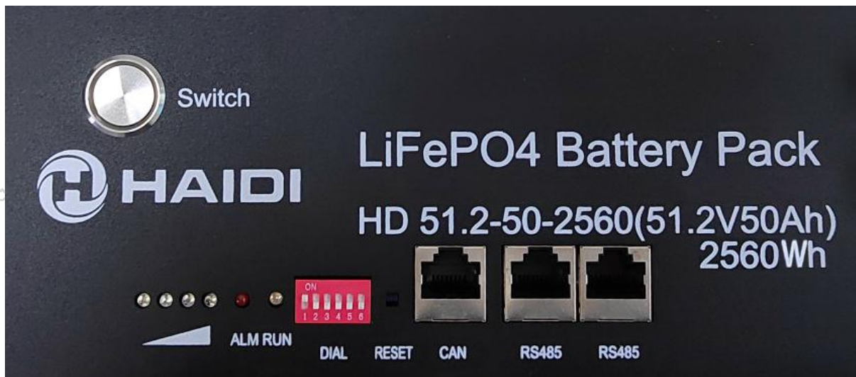
Figure 3 Battery Label (标签图)