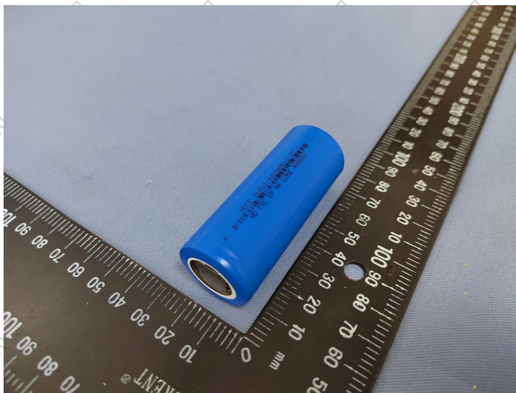
Figure 4 Overall view of cell (电芯外观图)